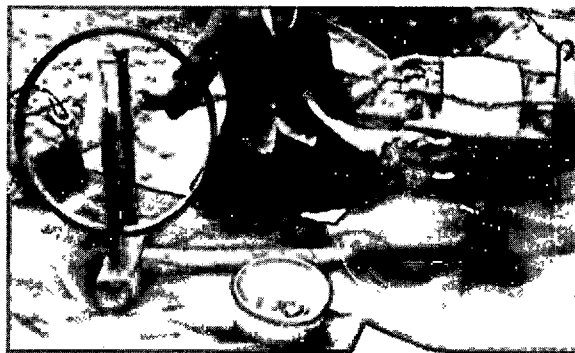
Figure 1: Silk thread preparation.

In order to weave silk, two sets of threads are interlaced by the weaver. There is a weft thread set perpendicularly called “Mai Yuan” and the other thread set as a warp thread in the shuttle called “Mai Poong Sen”. Both sets need to be prepared before the weaving process. The preparation is made with “Tee Glyo” process which means combining the silk threads together to increase the thickness and stickiness. The process is made by twisting them together as strain. Then the twisted thread will be winded onto a tube and pulled in and out with appropriate length and speed. Traditional thread preparation tool is operated by a weaver’s force of moving the wheel to rolling the thread with the right hand while the left hand pulls thread in the appropriate length and speed to get the required thickness and strains. Due to the mentioned process, workers get fatigue which leads to different number of strains in the thread. In order to solve the problem, an ergonomic process was considered to solve the problem and prevent any further problem by paying attention to the appropriate design of work and the workers [13]. This study aimed at exploring the prevalence of muscle aches due to working and factors affecting MSDs of the workers in silk thread preparation in a weaving group in Surin province.